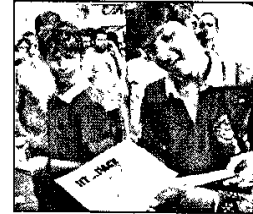
Getting off the mark

The views expressed by the author are personal